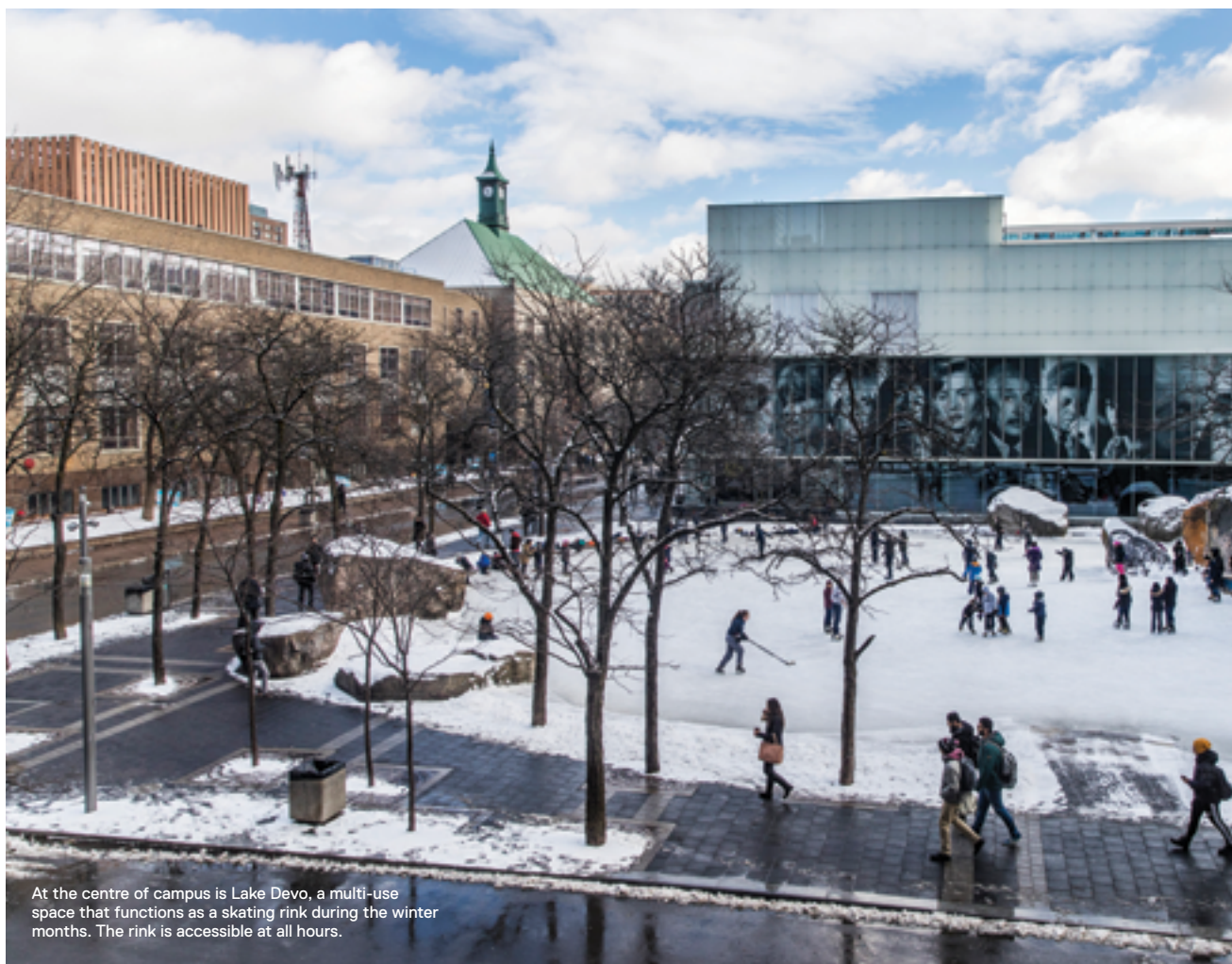
At the centre of campus is Lake Devo, a multi-use space that functions as a skating rink during the winter months. The rink is accessible at all hours.