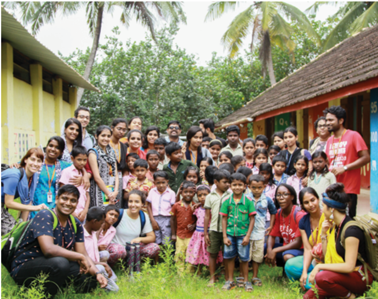
Below: Ryerson students on a field research trip shifted their focus to disaster relief during the worst flooding to hit Kerala, India in 100 years.