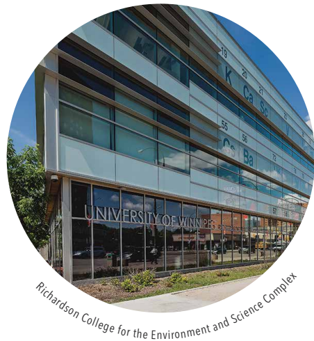
Richardson College for the Environment and Science Complex