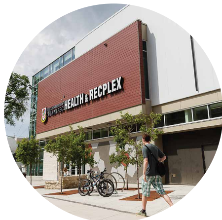
Axworthy Health and RecPlex

“I have the opportunity to gain hands-on experience and to interact with professors because of the small class sizes offered here at UWinnipeg.”